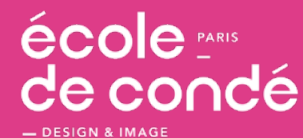
Photo in Paris with École de Condé

The photographic image is at the heart of the creative process. Taking photograph is a call to learn and see. This summer session will allow you to understand that composition is a vehicle of meaning, and a way of grasping the effects of light. In the different classes, you will discover the professional photography: produce photo with different tools, create a realisation and understand the entire process of creation. Beside the program at Ecole de Condé, this is the opportunity to be amazed by a Summer in Paris, the city of lights.